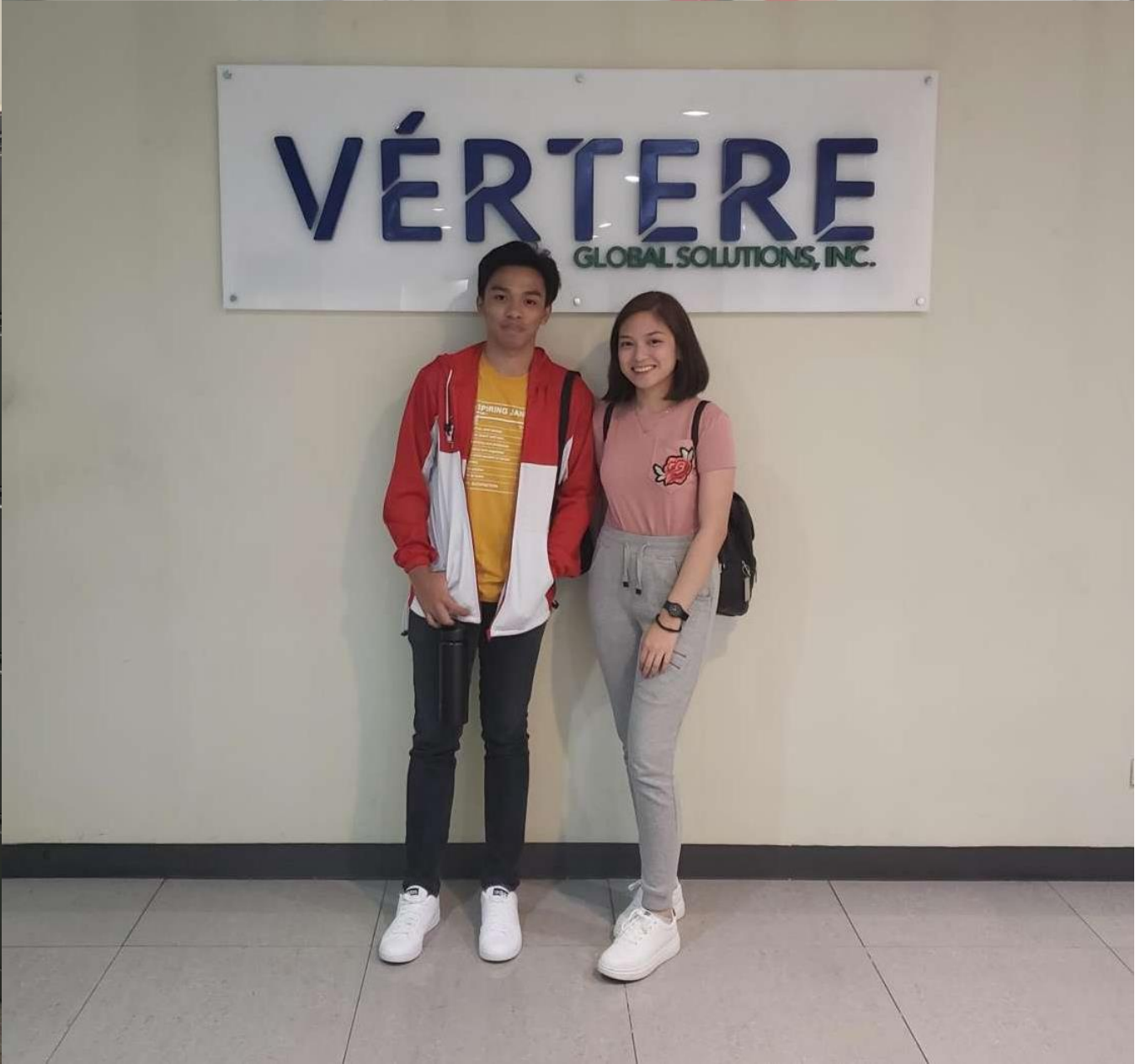
Learners who helped us to complete Dynafile backfiles