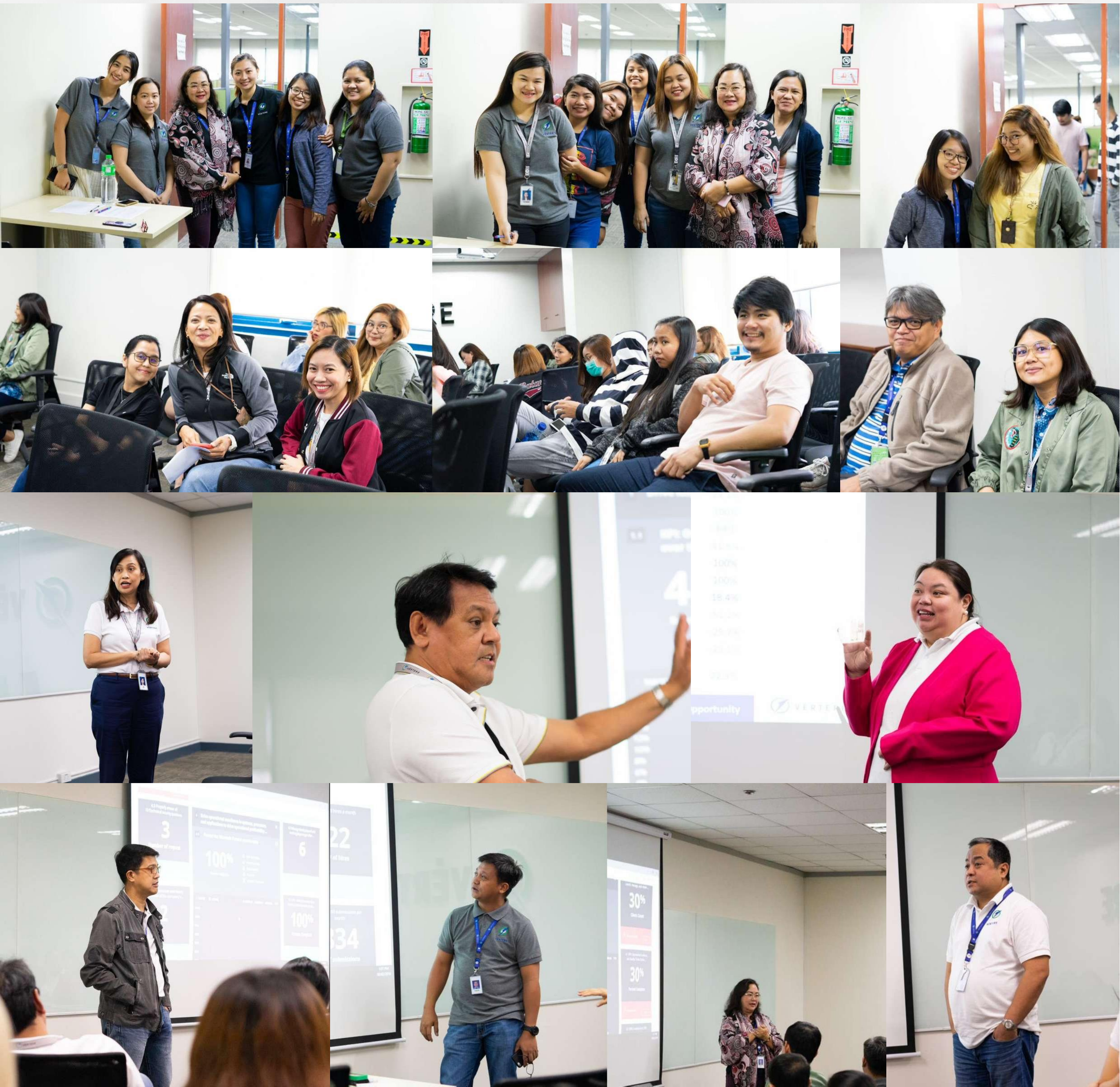
Townhall Quarter 2 2019 Vertere Back Office Team