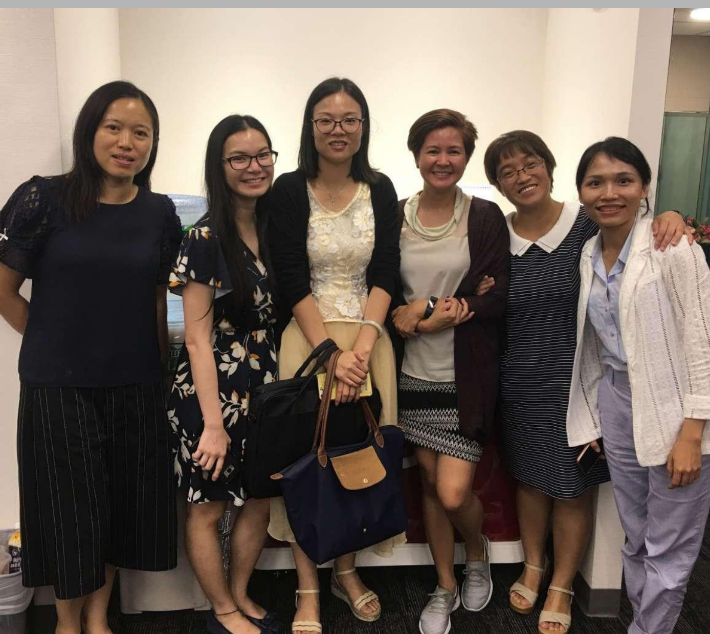
Travel opportunities: Hongkong Business Trip