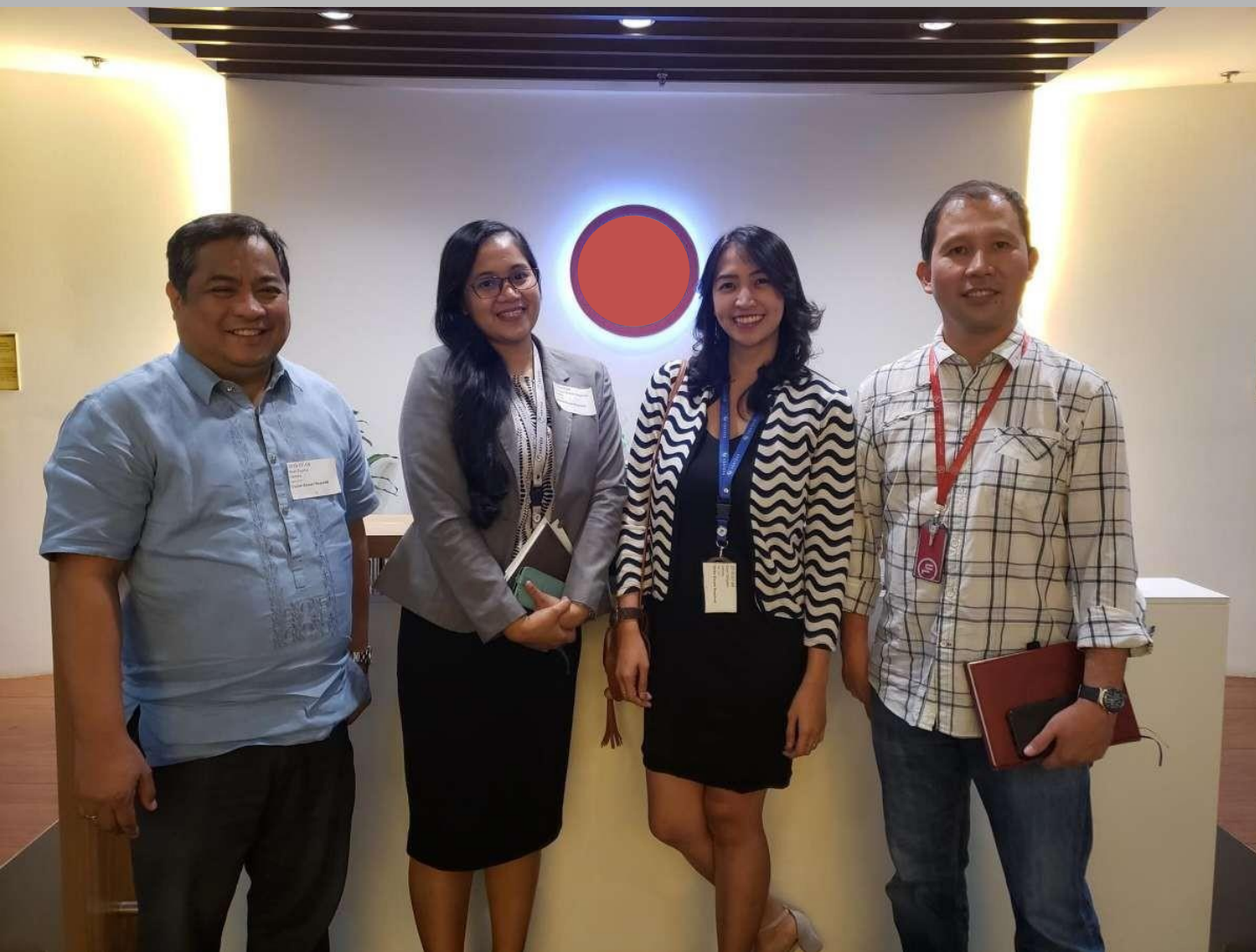
Visit with a global independent safety science technology client